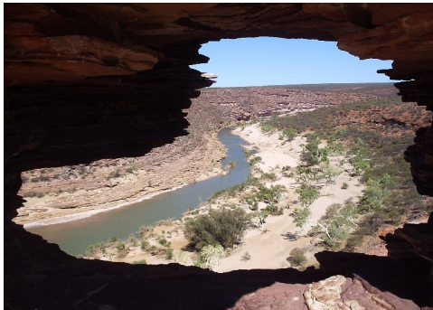
Rivers in Desert Places